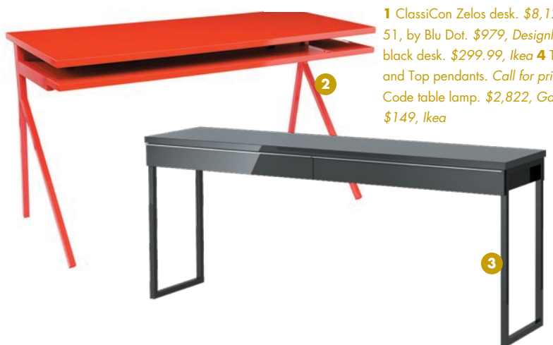
1 ClassiCon Zelos desk. $8,129 Inform Interiors 2 Desk 51, by Blu Dot. $979, Designhouse 3 Besta Burs high-gloss black desk. $299.99, Ikea 4 Tom Dixon pressed-glass Bead and Top pendants. Call for pricing, Inform Interiors 5 Vibia Code table lamp. $2,822, Gabriel Ross 6 Brasa floor lamp. $149, Ikea

QUALITY IS KING "A must-have for me in my work space is quality," says Meade. "It lasts longer, and these are things that you touch every day." Foundation pieces, like desks, lamps, chairs and tables can be as stylish as they are functional.