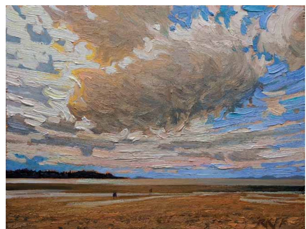
Tide's Out oil on panel 12" x16"